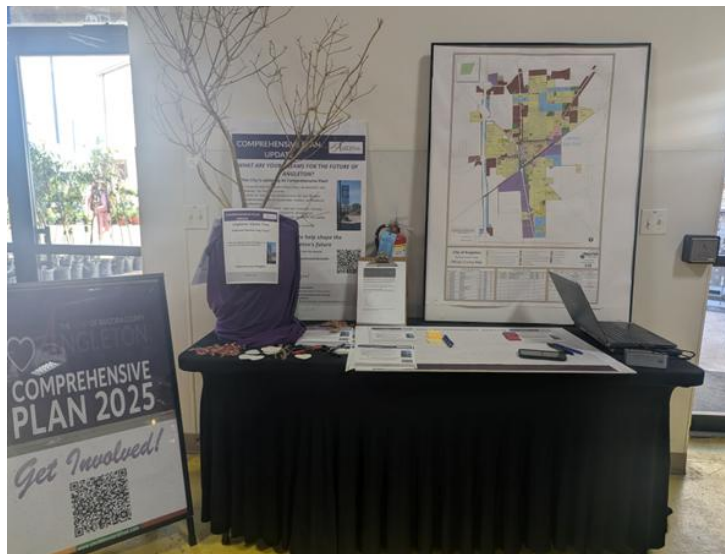
Comprehensive Plan Outreach Booth

It was observed that most of the fair visitors were not Angleton residents. Over 20 participants, including families with children and seniors, visited the booth and engaged in activities.