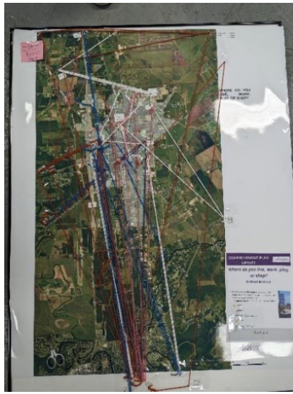
Pin Map Exercise