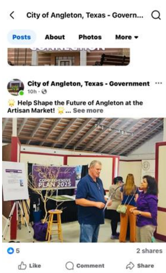
Facebook Post on the Day of the Event