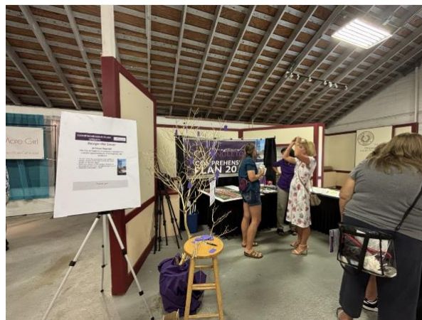
Engagement with Participants